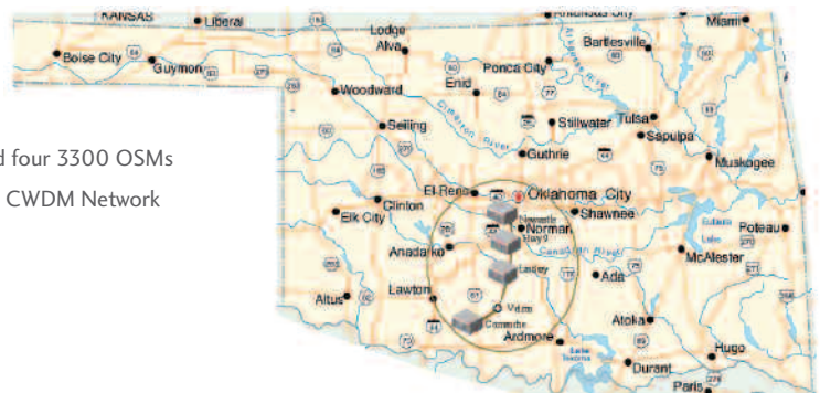
Figure 1: Phase 1 comprised four 3300 OSMs to form a Regional CWDM Network

The products used for Pioneer's network included Meriton Networks' 3300 OSM (Optical Services Multiplexer), 8300 EMS (Element Management System) and 8600 NMS (Network Management System).